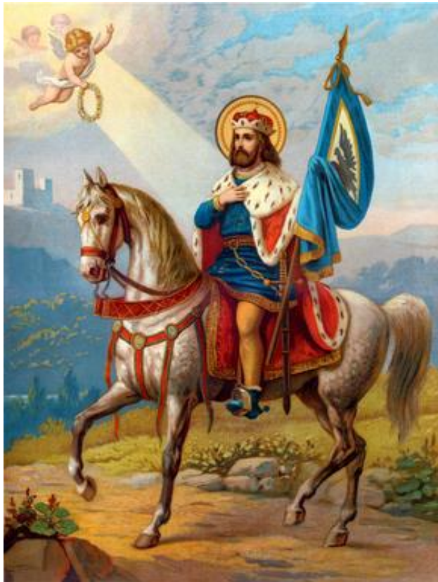
St. Wenceslaus, Duke, Martyr

The Society of St Pius X St Anthony 12A York St, PO Box 7123 WANGANUI info@ssp.org.nz Ph (06) 344 3814 www.ssp.org.nz